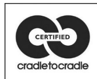
CERTIFIED CRADLETOCRADLE & Design (Color)