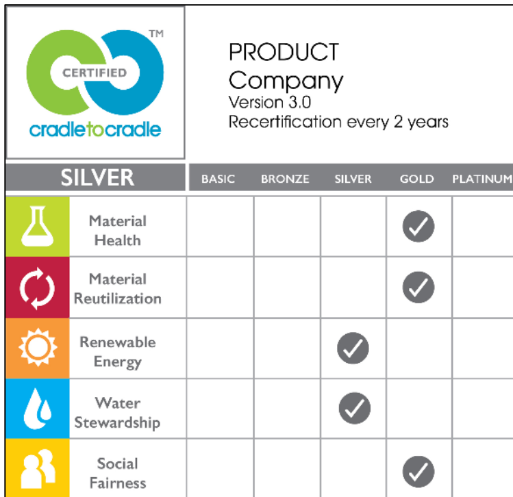
Available Scorecard Template